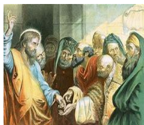
Matthew 22:21 Repay to Caesar what is Caesar's and to God what is God's