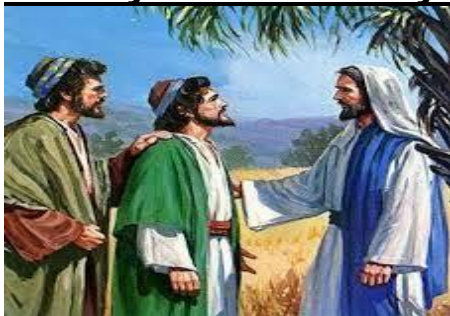
Gospel Mk 10:35-45

James and John, the sons of Zebedee, came to Jesus and said to him, "Teacher, we want you to do for us whatever we ask of you." He replied, "What do you wish me to do for you?" They answered him, "Grant that in your glory we may sit one at your right and the other at your left." Jesus said to them, "You do not know what you are asking. Can you drink the cup that I drink or be baptized with the baptism with which I am baptized?" They said to him, "We can." Jesus said to them, "The cup that I drink, you will drink, and with the baptism with which I am baptized, you will be baptized; but to sit at my right or at my left is not mine to give but is for those for whom it has been prepared." When the ten heard this, they became indignant at James and John. Jesus summoned them and said to them, "You know that those who are recognized as rulers over the Gentiles lord it over them, and their great ones make their authority over them felt. But it shall not be so among you. Rather, whoever wishes to be great among you will be your servant; whoever wishes to be first among you will be the slave of all. For the Son of Man did not come to be served but to serve and to give his life as a ransom for many."