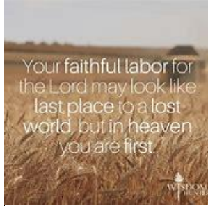
Matthew 20:15 Are you envious because I am Generous?