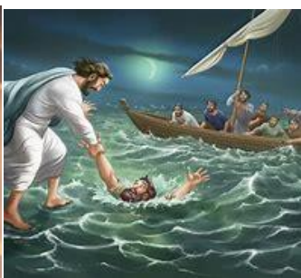
Matthew 14:27 Take courage, it is I; do not be afraid.