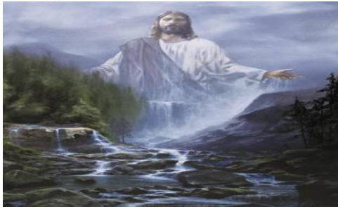
Isaiah 55:1 All you who are thirsty come to the water