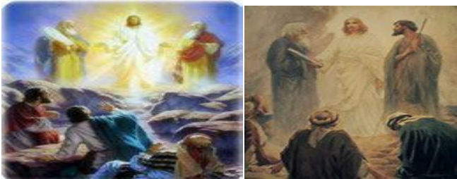
Mathew 17:2 Christ's face became as dazzling as the sun, his clothes as radiant as light